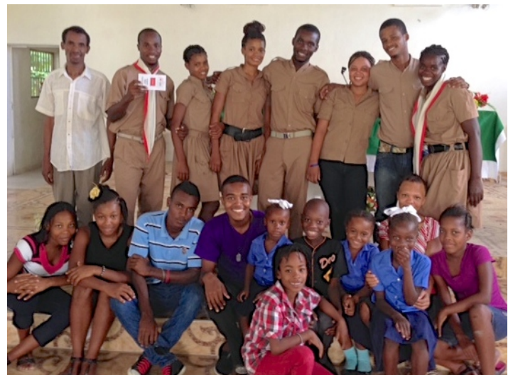
2014 boys and girls scout camp at St. André's.